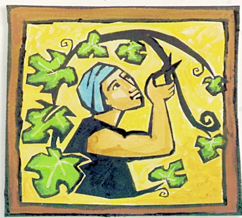
I am the Vine, You are the Branches