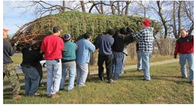
Christmas Tree Lot is Open for Business