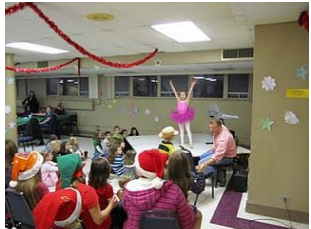
Christmas Party on December 17th, 6:00pm - Have the kids ready for the Talent Show