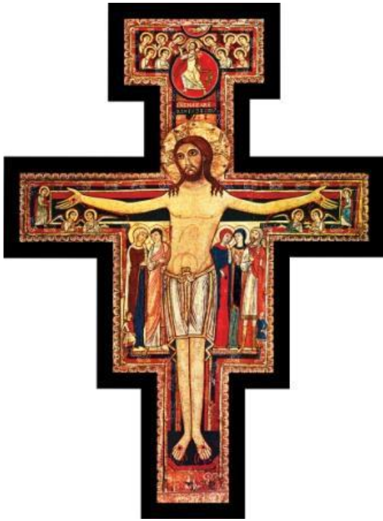
New in Church (San Damiano Cross) - This is a replica of the cross where St Francis heard the Lord's voice say, "Francis, go repair my house which as you see is falling into ruin."