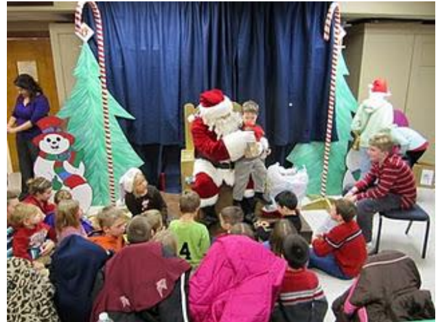
Christmas Party on December 17th, 6:00pm - Have the kids ready for Santa