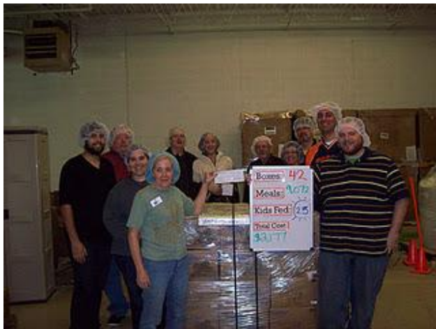
Knights and families assisting at Feed My Starving Children