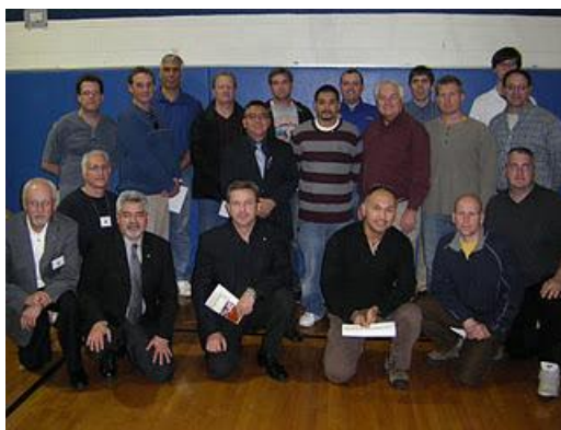
October 30 - Major Degree (2nd and 3rd) Knights