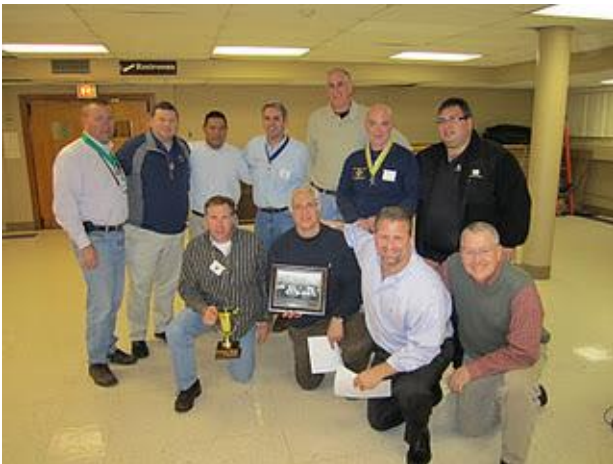
Turkey Bowl participants from November (Game 2 was 12/31/2011)