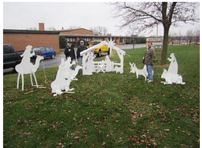
13 Large Nativity Sets were set up around town by our Knights this Christmas