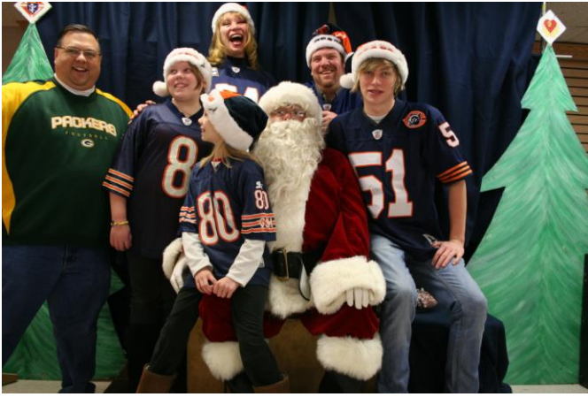
Fitzgerald Family (plus one) at Breakfast with Santa