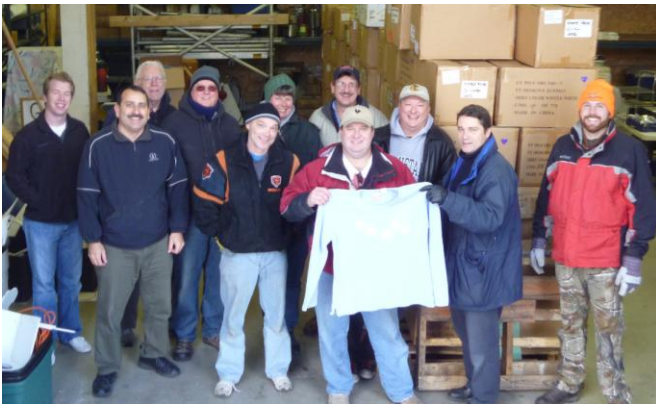
Knights and families helped donate 2750 Ladies Dress Sweaters to several needy charities this month